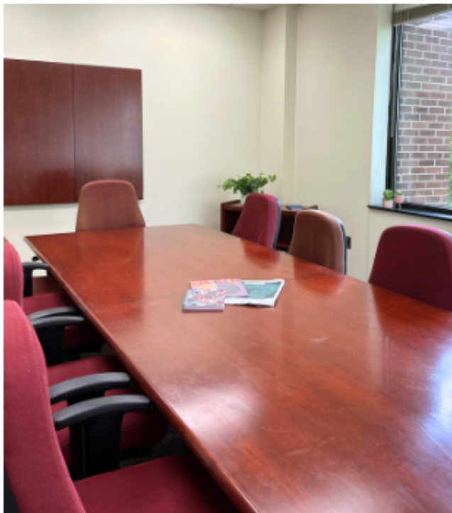
Conference rooms available by reservation