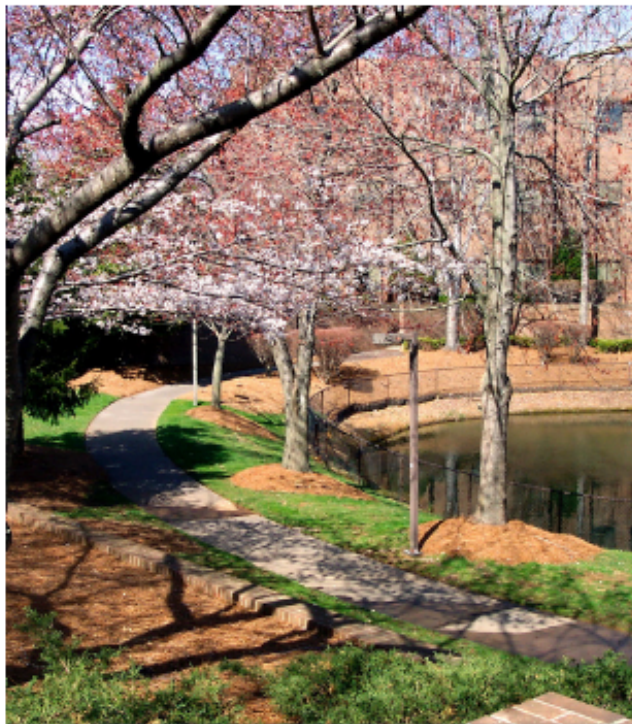
Beautiful landscaping and patio area