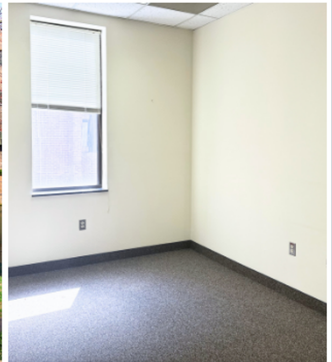
Natural light and quiet working environment