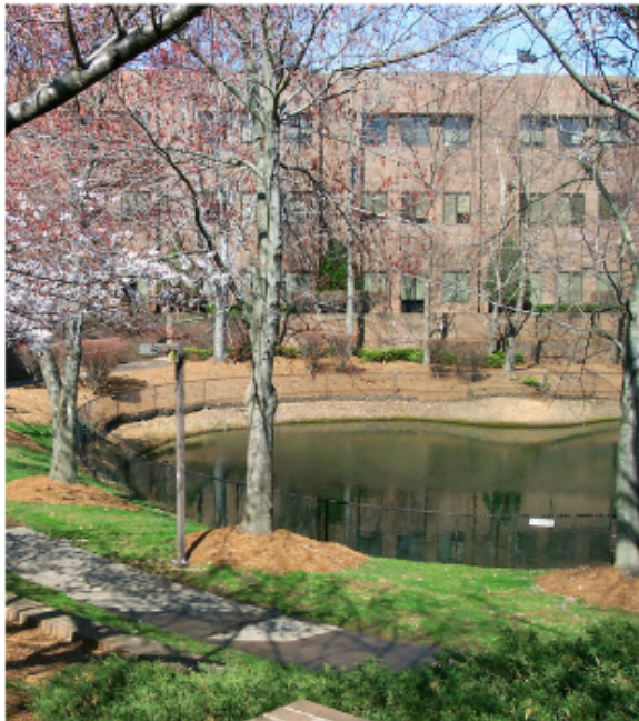
Beautiful landscaping and patio area