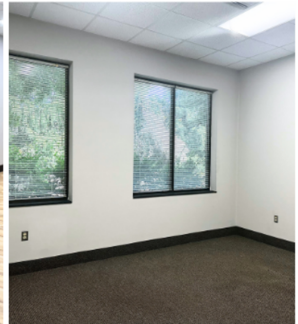
Large hard-walled offices throughout space