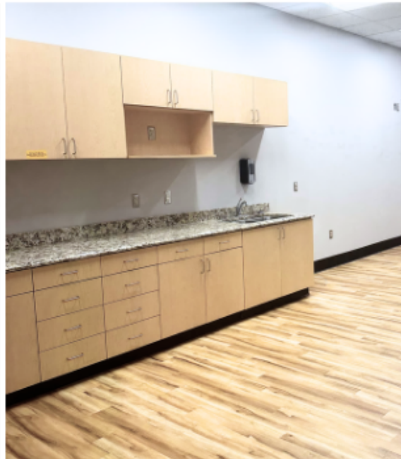
Modern Kitchen and breakroom spaces